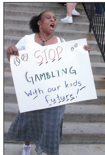
Parents waved signs and united with one another to demand the best for their children.

The mayor and the superintendent attended