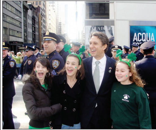
Republican gubernatorial candidate Rick Lazio (center), at the St. Patrick's Day Parade in New York City