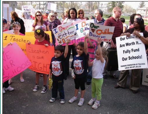
Future Yonkers Public Schools students joined in the effort to protest cuts to education funding, demanding that they deserve better.

The Yonkers Council of PTA/PTSA held a rally this week on the steps of Gorton High School; alongside parents and students were teachers, support staff and community leaders who joined together to protest budget cuts to education.